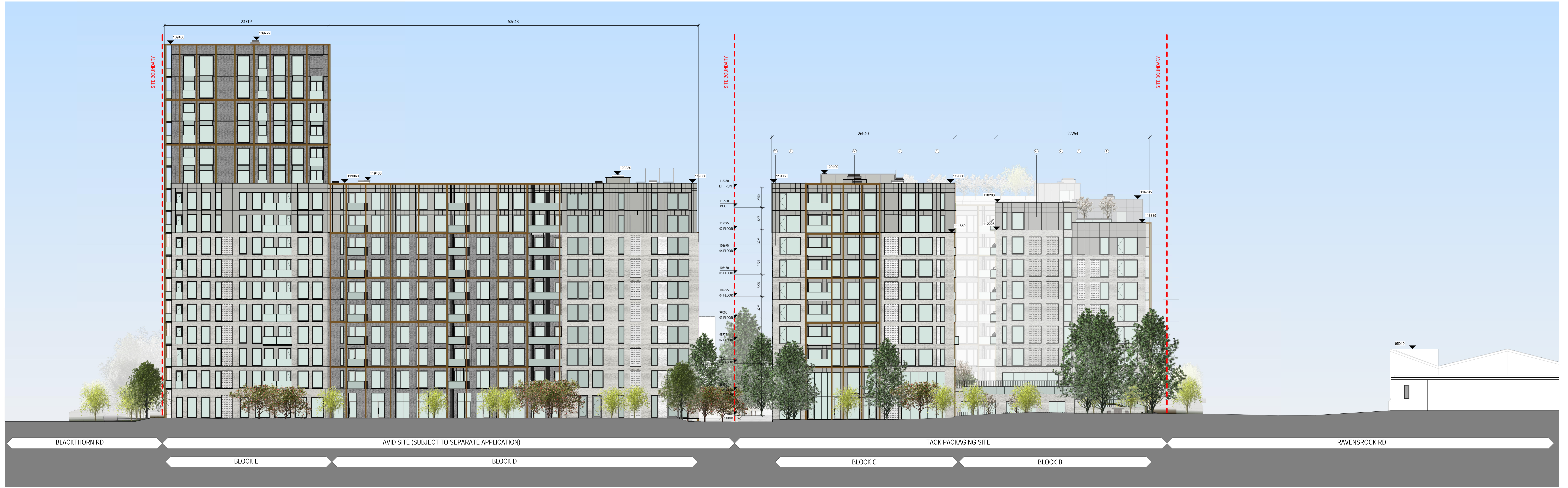
1 PROPOSED MASTERPLAN NORTH EAST CONTEXTUAL ELEVATION Scale: 1 : 200